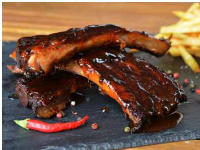
*Pork Sticky Ribs