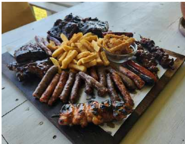
*Meat & Sausage Platter