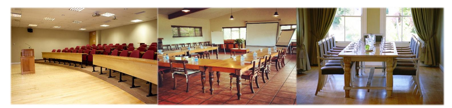
Auditorium Clubhouse Boardroom