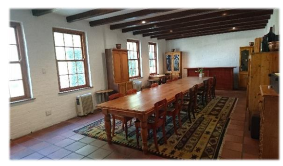
Private tasting Room