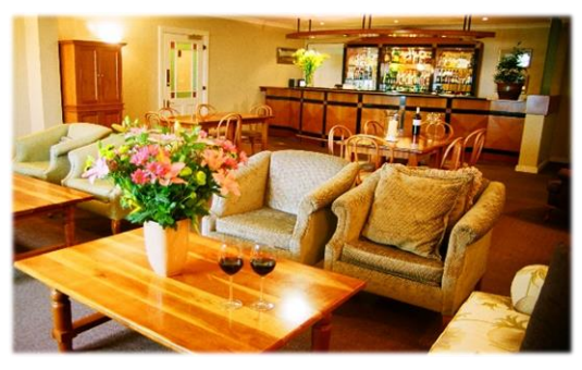
Country Inn Lounge