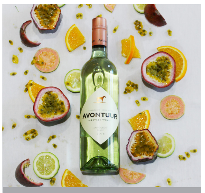
Buy 6 bottles of our brand-new 2018 Sauvignon Blanc in the tasting room and only pay for 5.

If you can visit us to taste and buy, please do so, and if you can't, our SA wine shop at www.avontuurestate.co.za/wine-store-sa/ will deliver those wines right to your door!