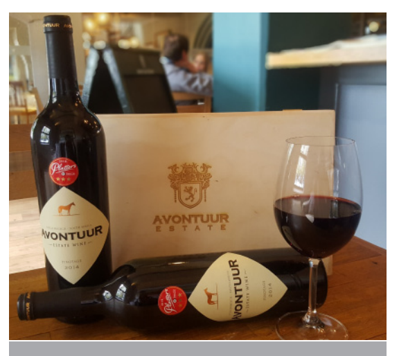
Pinotage 2014 is made in a new style and it's a big hit with Pinotage fans.

From Friday 12 October to Sunday 14 October our very popular Pinotage 2014 is available only from the tasting room at a "Buy- 5-get-1-Free deal". Take home six bottles, but you only pay for 5. Sounds like a winner!