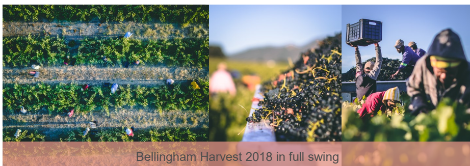
Bellingham Harvest 2018 in full swing

“At the onset of harvest, people were expecting a below average vintage, however, going on what we are tasting and seeing in the cellar, vintage 2018 was an above average vintage,” says Richard.