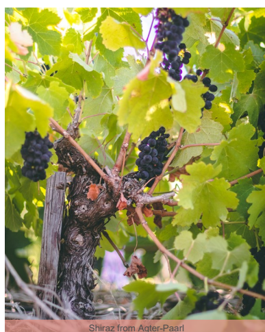
Shiraz from Agter-Paarl