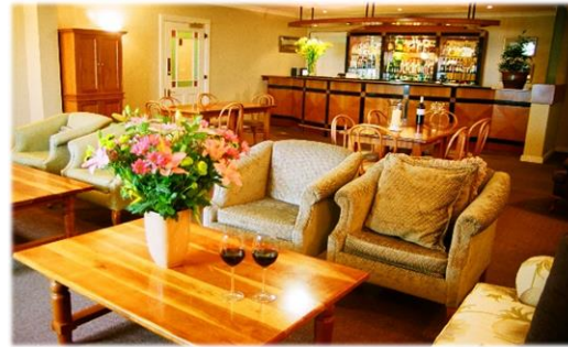
Country Inn Lounge