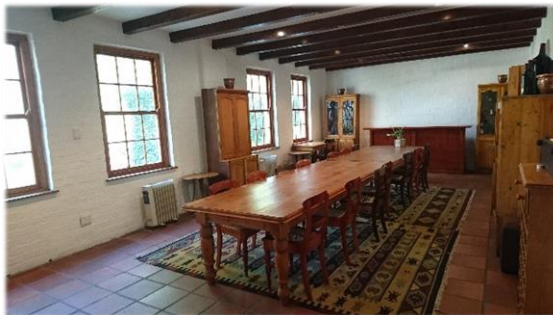
Private tasting Room